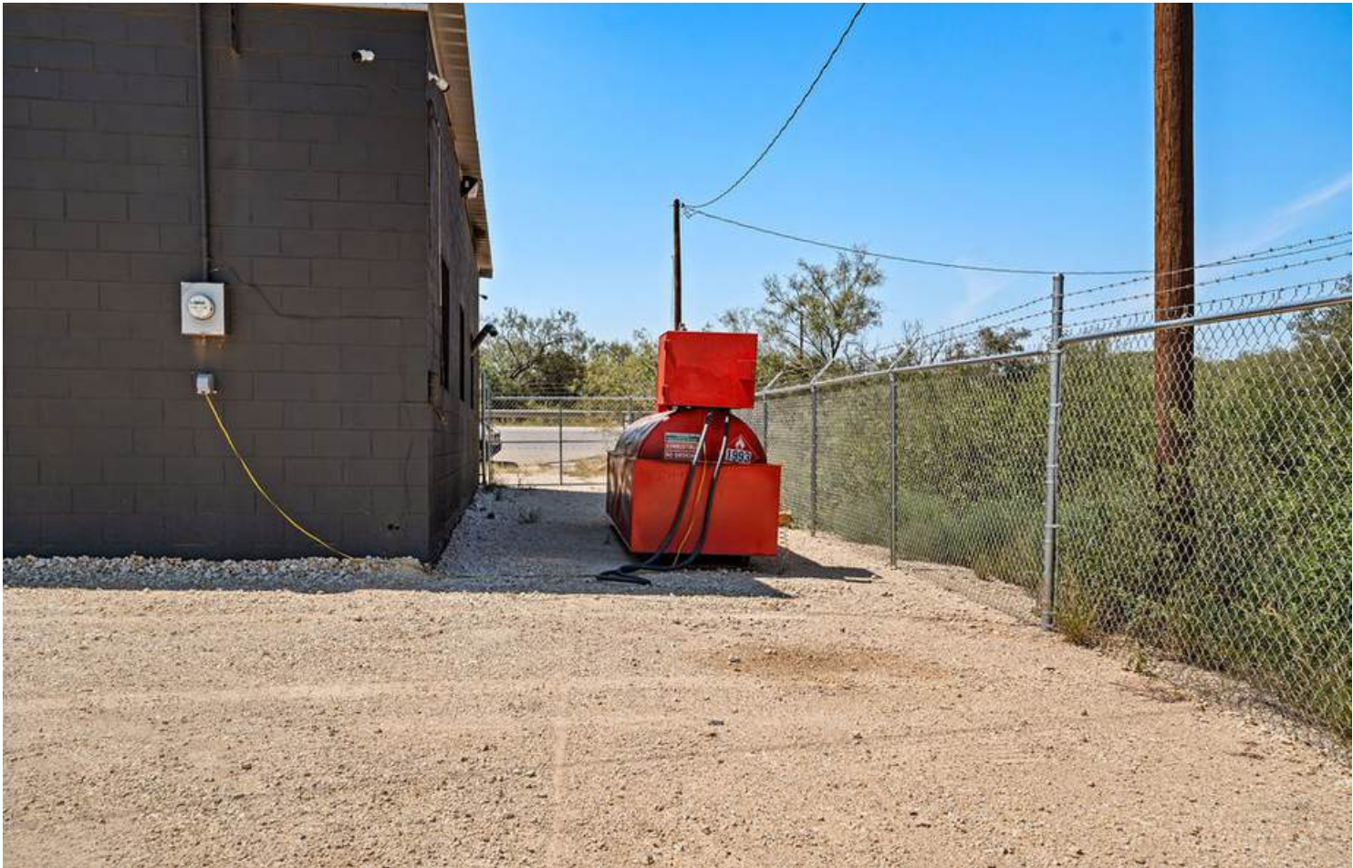
CAPITAL REALTY GROUP AT FATHOM REALTY