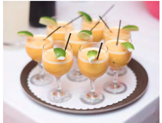
Sweet 16 & Quinceañera Packages