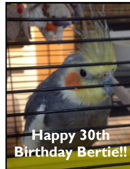
Happy 30th Birthday Bertie!!