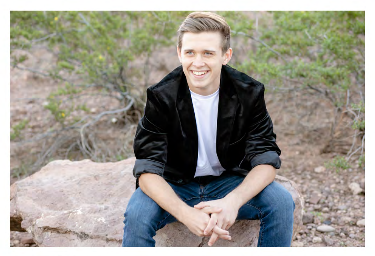
Summer BEAR PHOTOGRAPHY