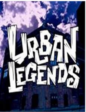
URBAN LEGENDS (2007)