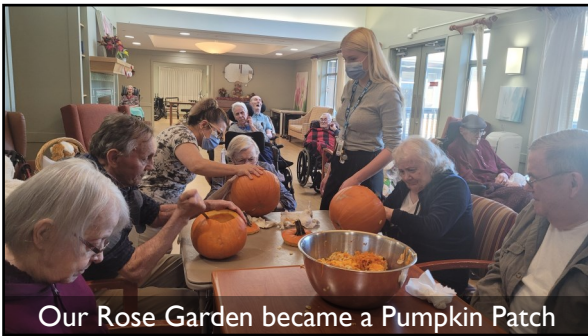
Our Rose Garden became a Pumpkin Patch