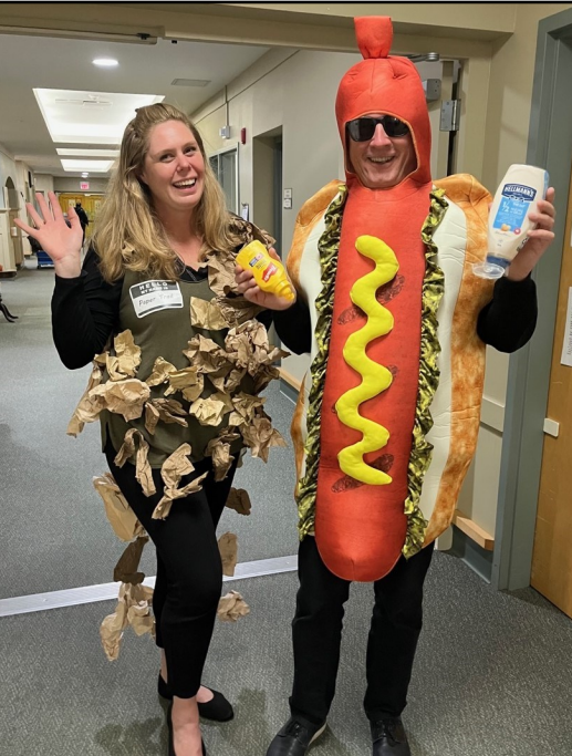
Our leaders: "Paper Trail" & "Top Dog"