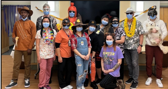
Halloween this year requires two masks!