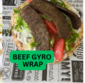
BEEF GYRO WRAP

Three Pieces Turkish style thinly sliced grilled beef with homemade Tzatziki sauce served with tomatoes, onions, lettuce, all wrapped in a fresh warm pita. Meal comes with ratatouille, bulgur and your choice of soup or salad.