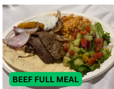
BEEF FULL MEAL