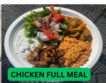
CHICKEN FULL MEAL