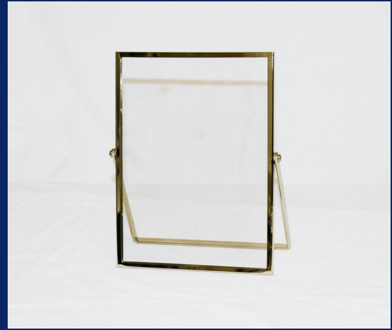
FLOATING FRAME - GOLD