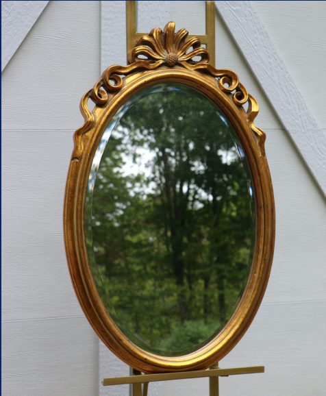
THE WEDDING PLANNER