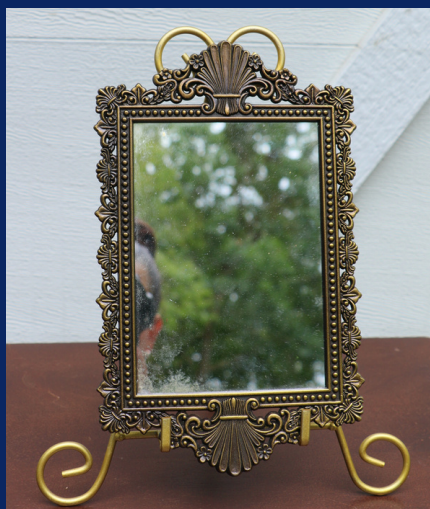
MEET THE PARENTS