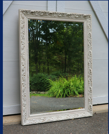
SWEET HOME ALABAMA