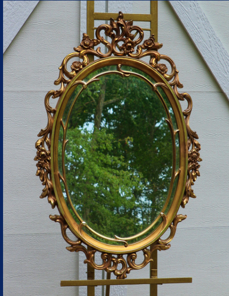
MADE OF HONOR