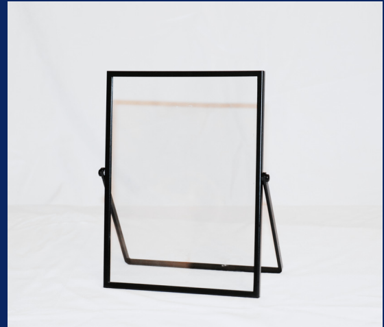
FLOATING FRAME - BLACK