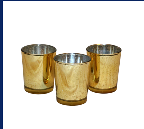
MERCURY GLASS - GOLD