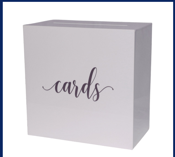
WHITE ACRYLIC BOX