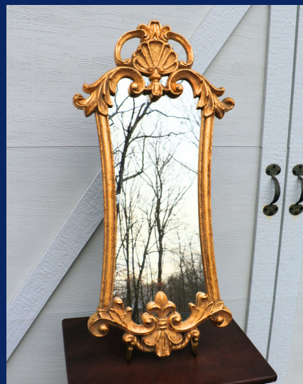
TICKET TO PARADISE