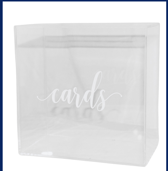
CLEAR ACRYLIC BOX