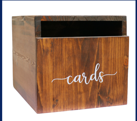
STAINED WOOD BOX