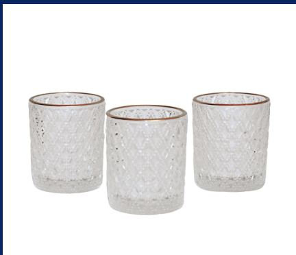
FROSTED GOLD RIM