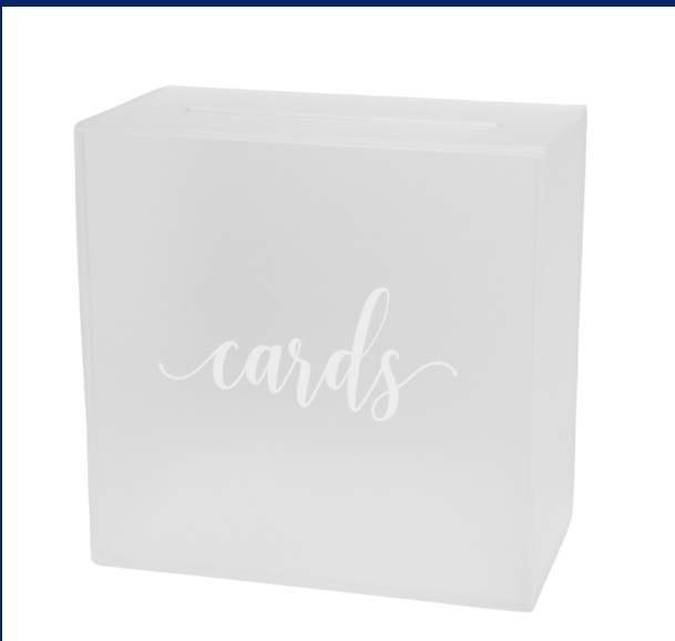
FROSTED ACRYLIC BOX