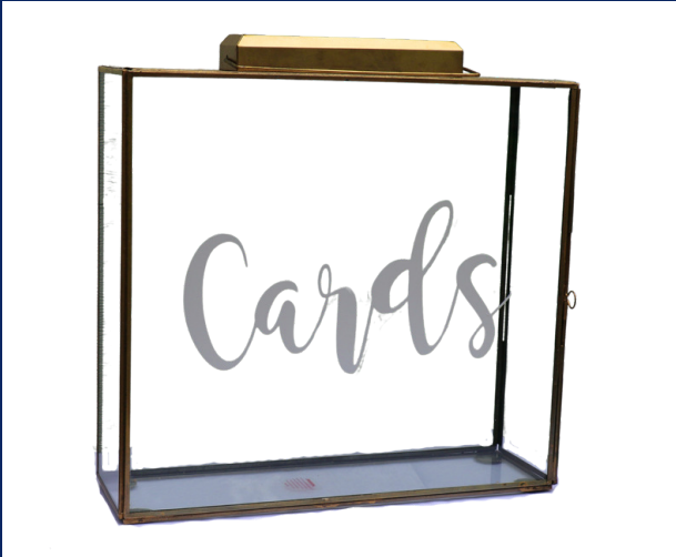
GLASS & METAL BOX