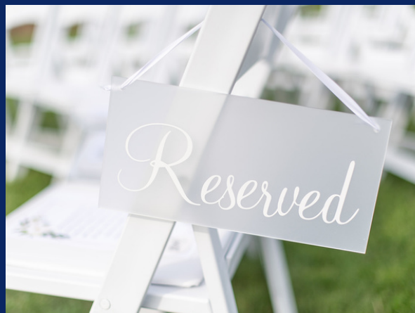
RESERVED SIGNS FOR CEREMONY CHAIRS