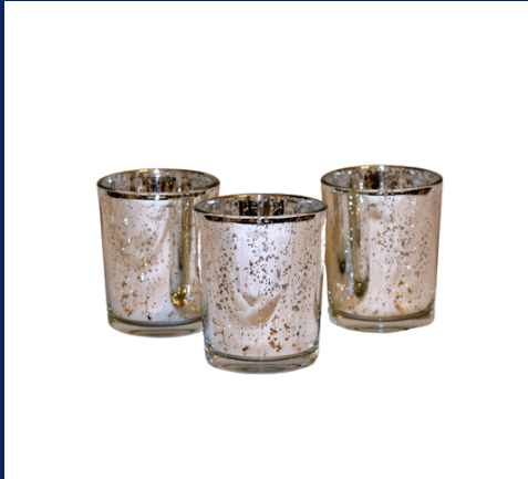
MERCURY GLASS - SILVER