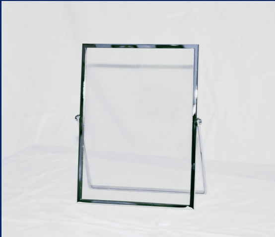
FLOATING FRAME - SILVER