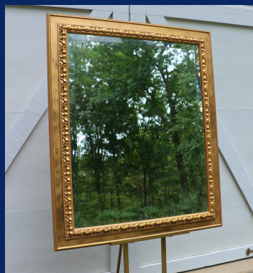
FATHER OF THE BRIDE