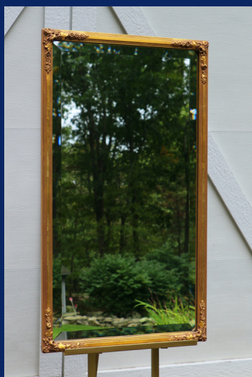
THE WEDDING SINGER