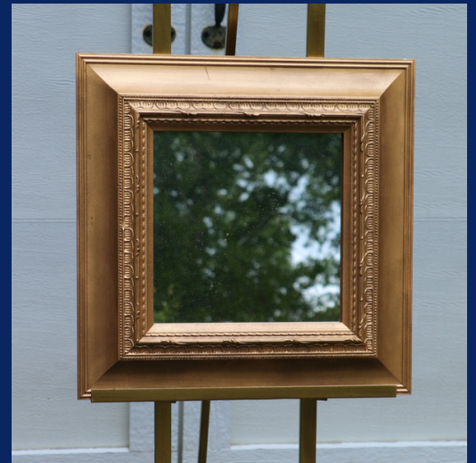
JUMPING THE BROOM