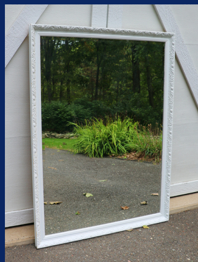
A WALK TO REMEMBER