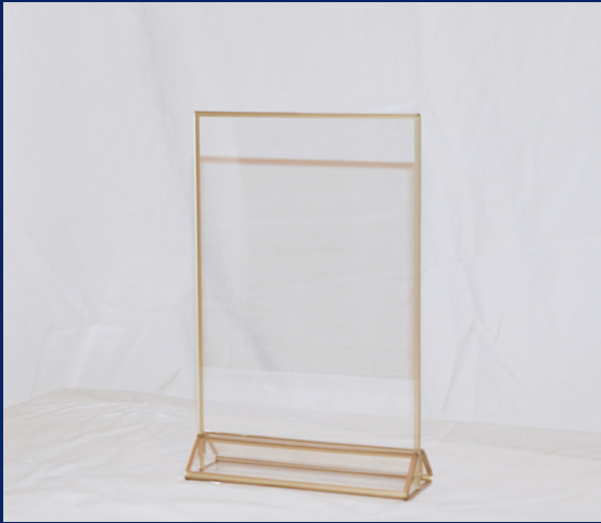
GOLD & ACRYLIC FRAME

THESE FRAMES CAN BE USED FOR PRINTED PAPER NUMBERS OR WITH VINYL