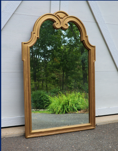
THE WEDDING DATE