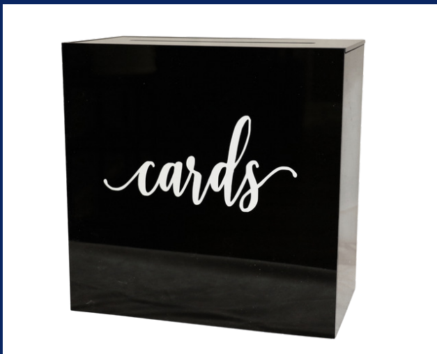
BLACK ACRYLIC BOX