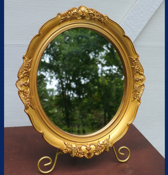
MY BEST FRIEND'S WEDDING