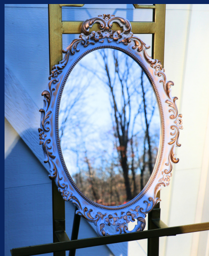
MY BIG FAT GREEK WEDDING