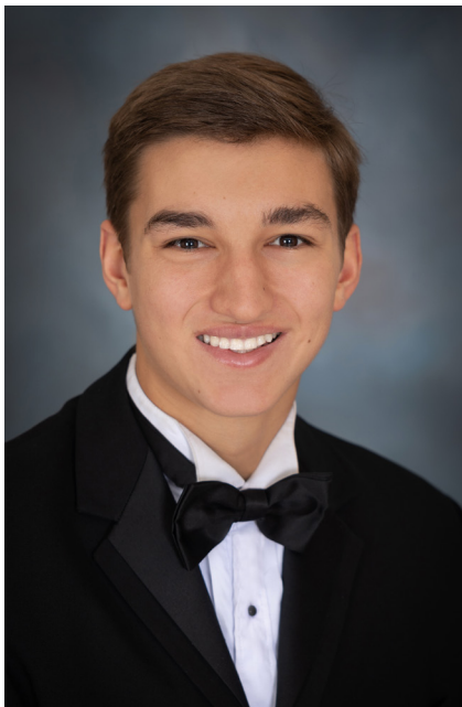
Tux available at the studio

*Be sure to shave, comb hair, and brush teeth before arriving at the studio for your formal portrait. Delone seniors must follow all school guidelines: clean shaven and neat hair.