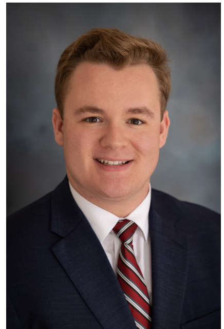
Wear your own shirt, tie & jacket