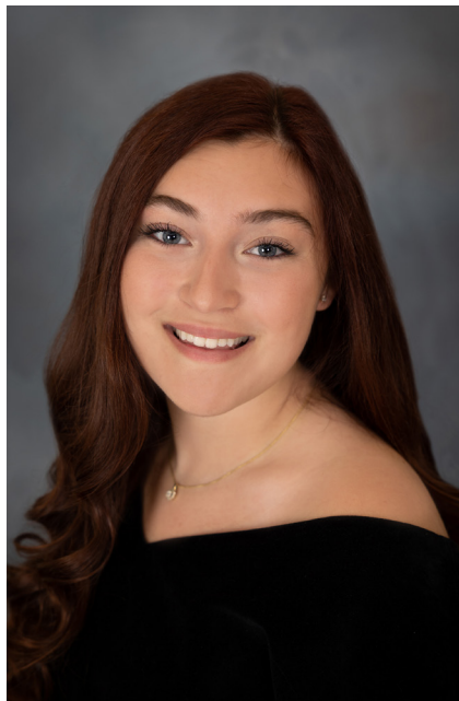
Formal drape at the studio